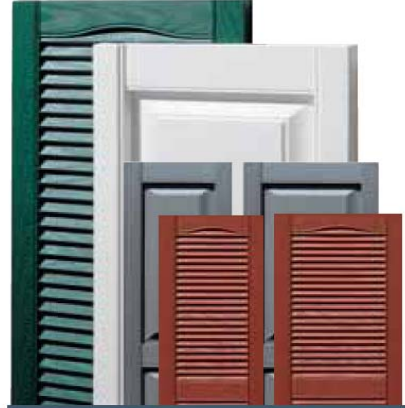
In two standard widths—12" and 15"

Available in 16 maintenance-free accent colors, plus Paintable.