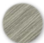
Timber Wolfe 74