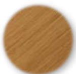
Harvest Brown 78