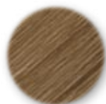
Warm Cedar 97